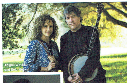
Abigail Washburn and Bela Fleck

For more information, call 866-571-2787 or 561-368-8445, or visit festivalboca.com .