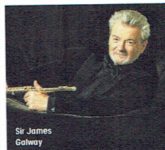
Sir James Galway