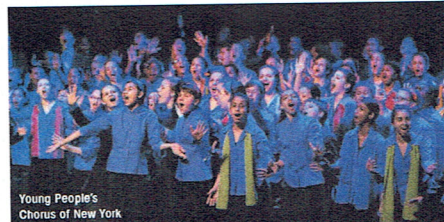
Young People's Chorus of New York