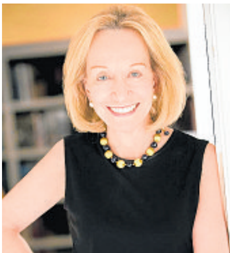
Pulitzer-Prize winning author Doris Kearns Goodwin, will speak at 7 p.m. March 13.

"Looking at, on a human level, the char-