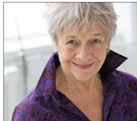
Estelle Parsons stars in My Old Lady at Palm Beach Dramaworks Dec. 5-Jan. 4.