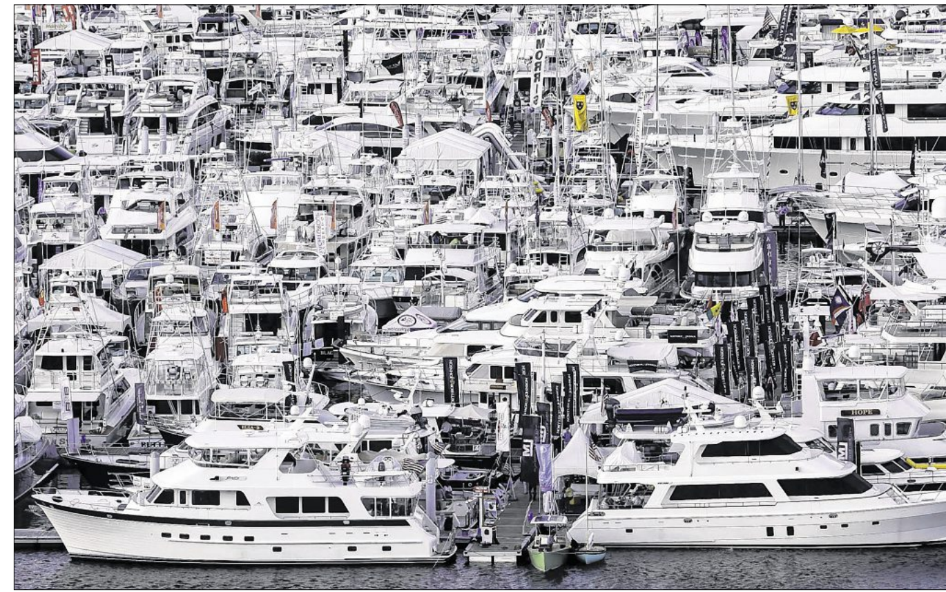
Ahoy! The 30th Palm Beach Boat Show takes to the water March 26-29.