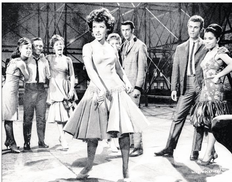
Festival Orchestra Boca will perform Leonard Bernstein's score to "West Side Story" while the 1961 film is screened in the Mizner Park amphitheater at 7:30 p.m. today.

Festival Orchestra Boca will perform Leonard