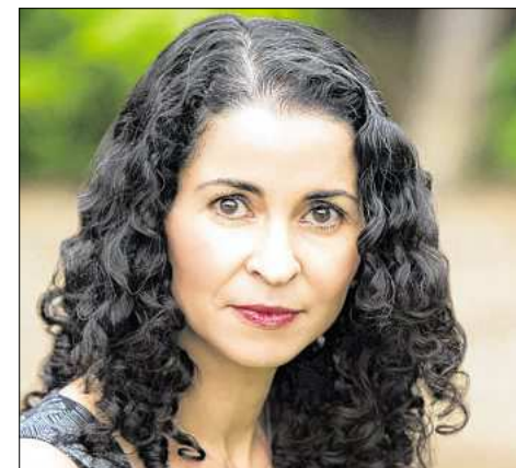
Author Laila Lalami, 2015 Pulitzer Prize finalist

Tickets: $15-225 per person Info: (866) 571-2787