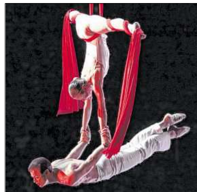
Cirque de la Symphonie