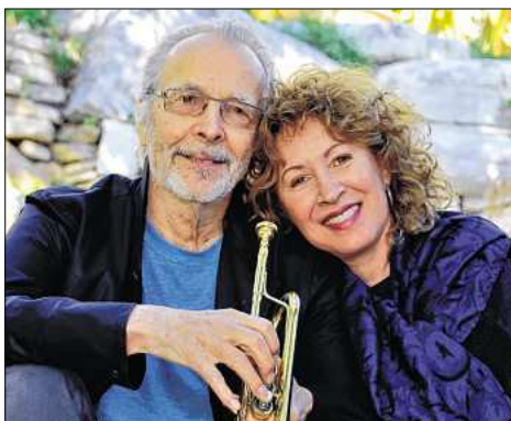
Jazz trumpet legend Herb Alpert and his wife, Grammy Award-winning singer Lani Hall