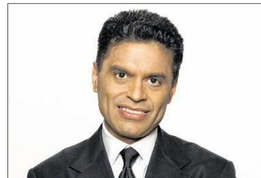
Fareed Zakaria, CNN host, contributing editor at The Atlantic , Washington Post columnist and author

NOTABLES COVERS SPONSORED BY FEATURED ORGANIZATIONS