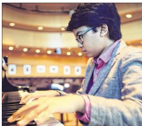
Joey Alexander, 12-year-old jazz piano phenom

Festival of the Arts BOCA. “We are thrilled and humbled to welcome a full line-up of international superstars, thinkers, authors and performers.”