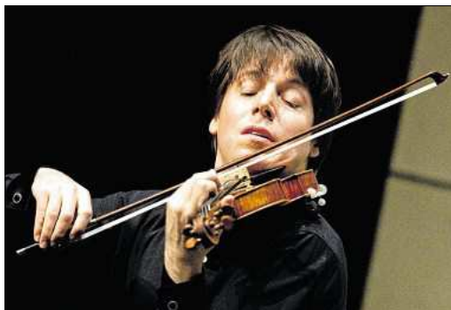
Violin superstar and conductor Joshua Bell, who will headline this year's Festival.