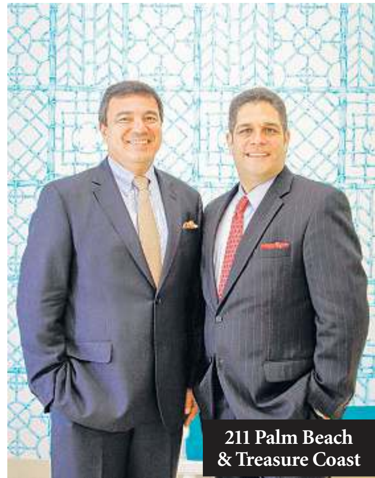
211 Palm Beach & Treasure Coast