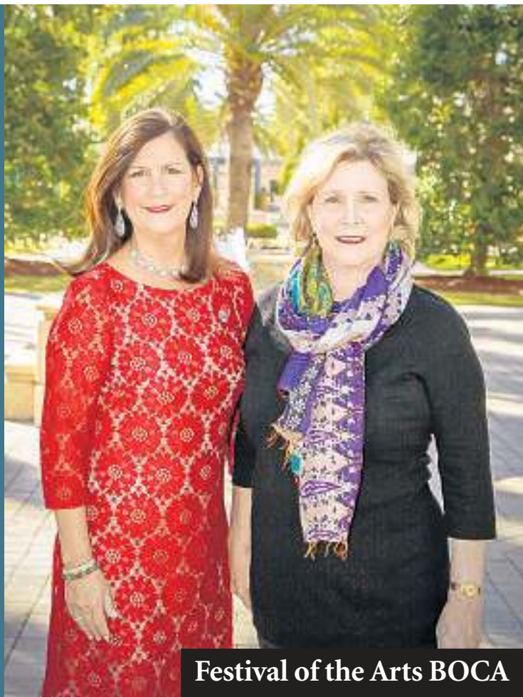
Festival of the Arts BOCA