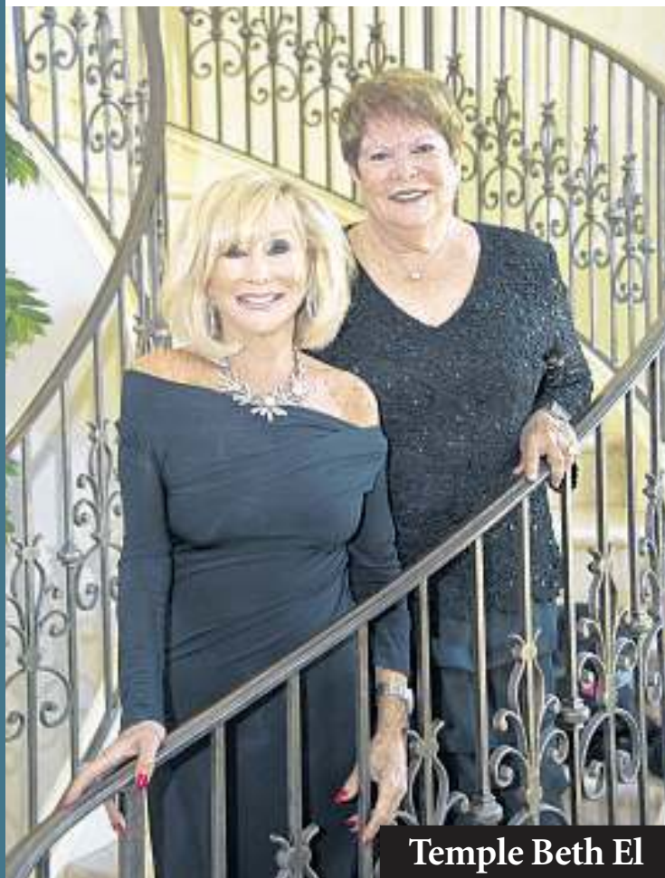
Temple Beth El