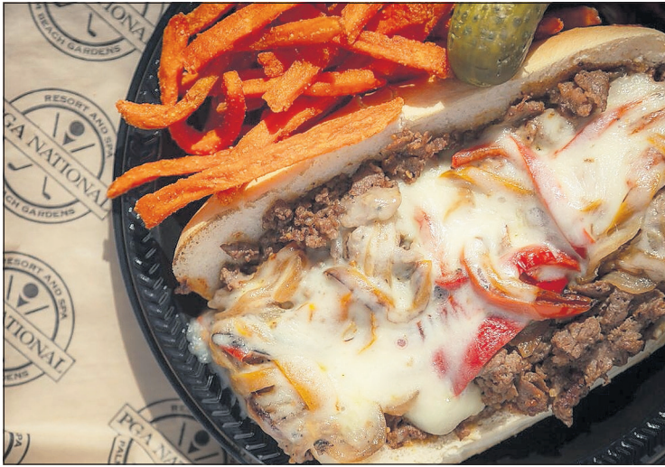
Honda Classic eats: a Philly cheesesteak, made with shaved rib-eye, at the PGA Resort.