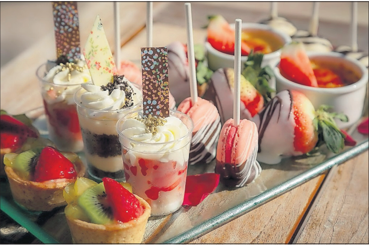
Honda Classic eats: an array of mini desserts from the kitchen at PGA National Resort, where such sweets adorn special buffets.

The Wave snack bar offers a limited but hearty mix of