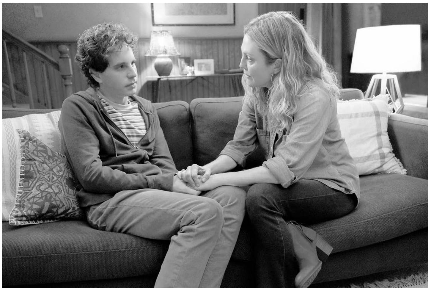
Ben Platt, left, and Julianne Moore in "Dear Evan Hansen."